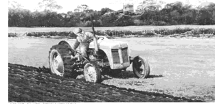
Vintage Tractors & Cars